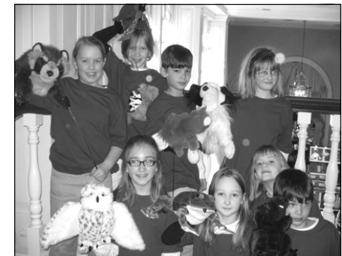
3rd Grade Puppet Team