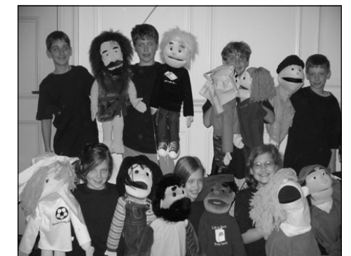
4th Grade Puppet

"Don't let anyone look down on you because you are young, but set an example for the believers in speech, in life, in love, in faith and in purity." 1 Timothy 4:12