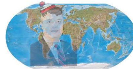
WHERE IN THE WORLD IS WALTO? Family Retreat : October 19, 20, 21 Henry Horton State Park

This weekend we hope to find Walto at Henry Horton State Park during our Family Retreat , however, we hope to learn that Walto is Here, There and Everywhere as we focus on all of the many ministry opportunities that we have at Brentwood Hills that will help all of us to proclaim daily.... Here am I...Send Me!